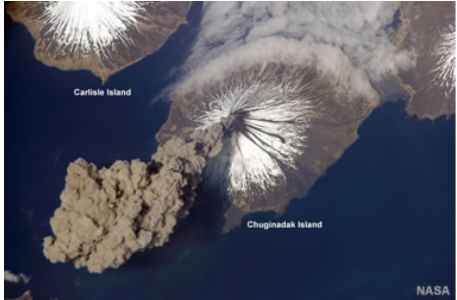
Volcanic ash plume from Cleveland Volcano, located on Chuginadak Island in the Aleutian Island Chain off Alaska.

https://geology.com/articles/volcanic-ash.shtml